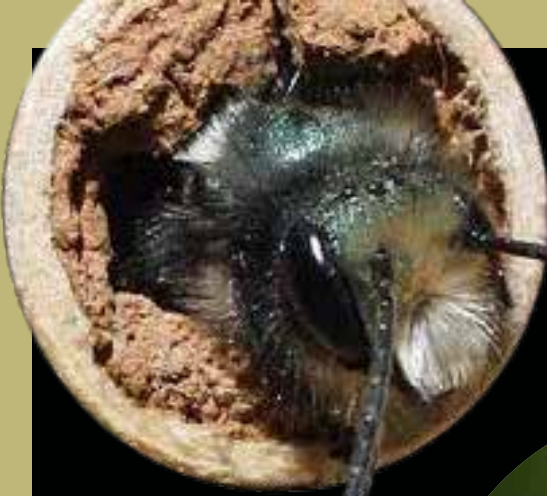
Mason Bee emerging from mud-sealed hole