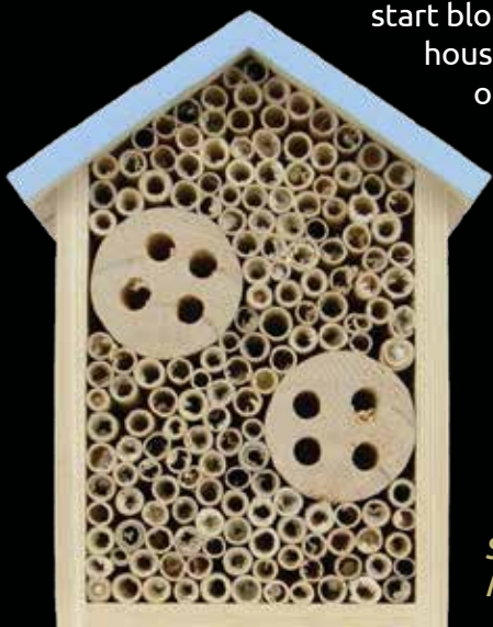
Store-bought Mason Bee house

Now is the time to consider erecting a "mason bee motel"—before the fruit trees start blooming. The bee houses available on-line and at nature stores like the one at Beechwood Farms are generally collections of different diameter tubes.