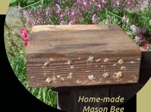
Home-made Mason Bee house